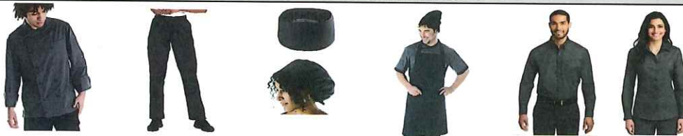
*CHEF COAT CHEF PANTS HATS APRON *FOH-MEN & WOMEN SHIRTS

Culinary Arts logo will be applied to the right side and first name only of the left side of the garment.